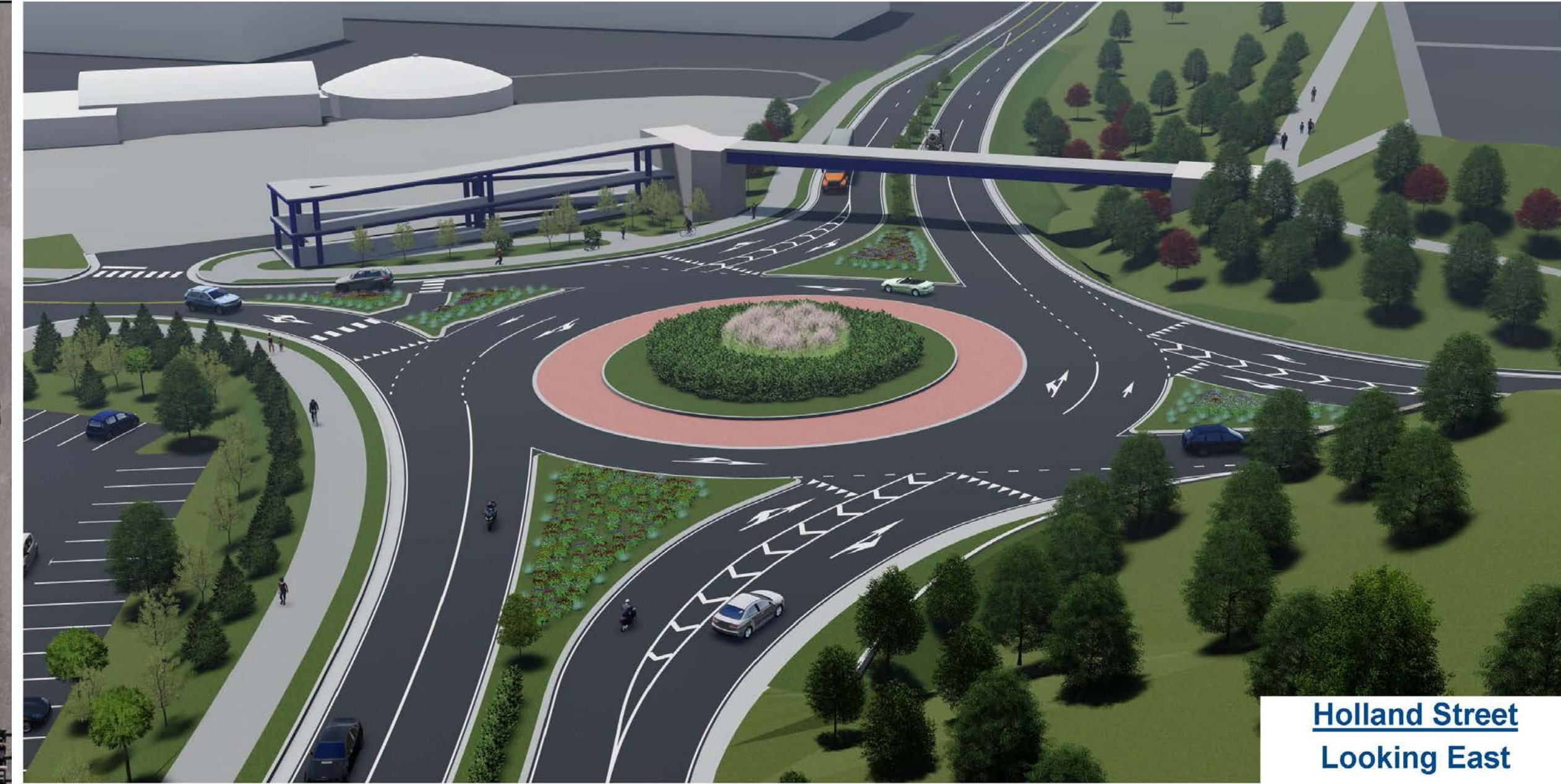
Holland Street Looking East