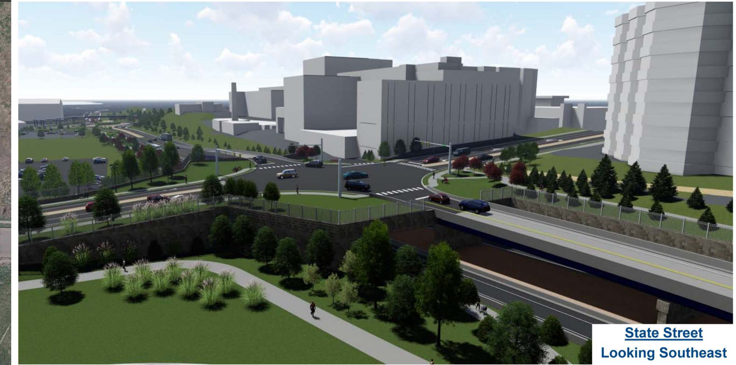
State Street Looking South

Grade Separated Intersection (Bayfront Parkway Through Traffic Passes Below State Street)